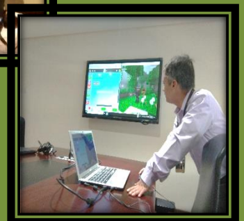
Paint3D make a showing