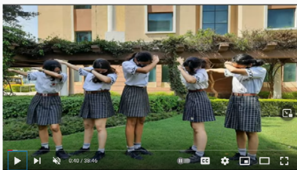
ICT, Foreign Languages and English WEEK_MONDAY Assembly 25th OCT 2021

The spell binding assembly concluded with the National Anthem and had the students all geared up for the interlude and postlude to follow in the week days ahead.