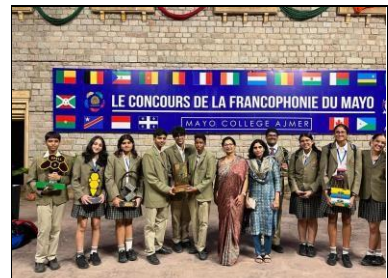
Students with their individual trophies