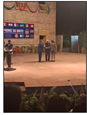
Some of the students receiving the awards