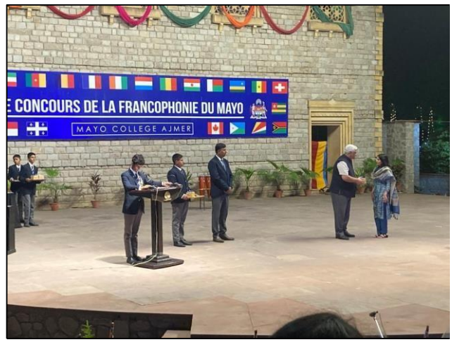
Suncity teachers being felicitated by Lieutenant General Kulkarni