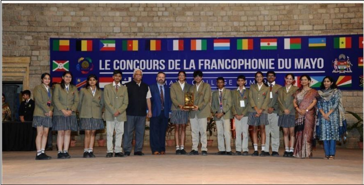
Receiving 'Le Dauphin du Concours' (Runners-up Trophy)