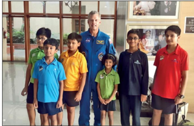
Former NASA astronaut Steven Ray Swanson with students

of working at NASA is being able to work with a dedicated, smart and enthusiastic team. Everyone cares greatly about NASA's mission to explore Space and works very hard to achieve that goal. To be part of that is a great feeling.